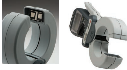
The clamp head of the DET14C/24C has a smooth mating surface and no interlocking teeth. Its large elliptical design improves access to the test specimen.