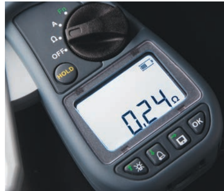
Close up of instrument's front panel.