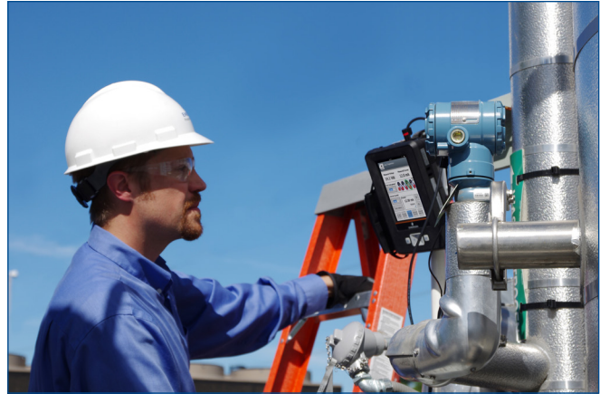
The magnetic hanger accessory allows you to attach the Trex unit to a pipe, freeing up your hands for other work.

You can also verify whether the DC voltage is correct in HART loops.