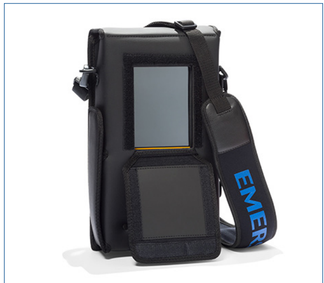
The useful carrying case protects your Trex unit in the field and provides storage options for accessory items.

Using the ValveLink Mobile app on the Trex unit, you can perform valve diagnostics in the field, including valve signature, dynamic error band, PD one button sweep, and step response, without having to pull the valve or perform invasive troubleshooting steps. ValveLink Mobile works with HART and FOUNDATION Fieldbus Fisher® FIELDVUE™ digital valve controllers and provides an intuitive user interface that is easy to understand and use. The large touchscreen on the Trex communicator makes it easier than ever to see all valve diagnostic details.