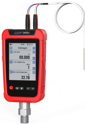
ADT260Ex with AM1602 temperature probe

Note: The ADT260Ex can be purchased without the ADT158Ex module if needed using the following part number: ADT260EX-NO