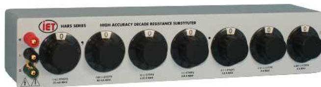
Figure 1-1. HARS Series High Accuracy Resistance Substituter

The larger units may be rack-mounted to serve as components in measurement and control systems.