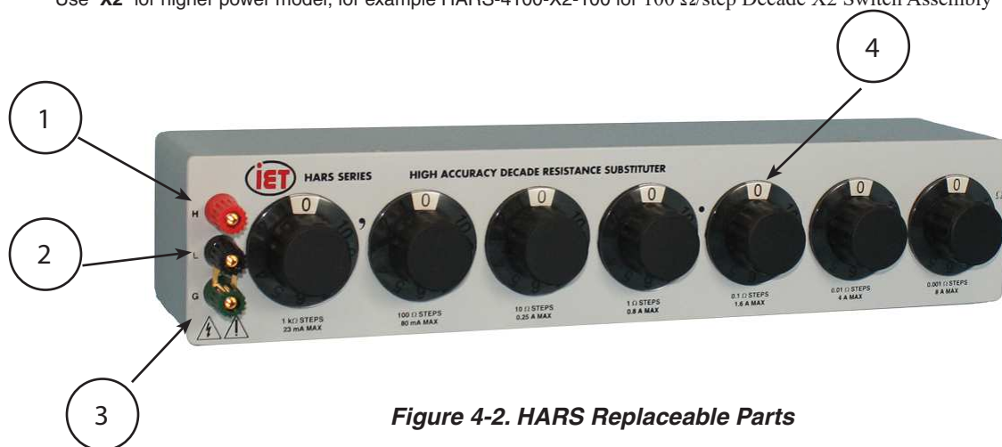
Figure 4-2. HARS Replaceable Parts

* Use "X2" for higher power model, for example HARS-4100-X2-100 for 100 \Omega /step Decade X2 Switch Assembly