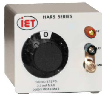
Figure 1-2. Single-Decade HARS Unit.