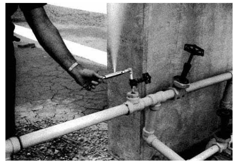
Valve Applied to Transfer Line