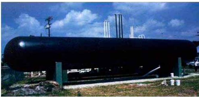
Valve Application on Tank