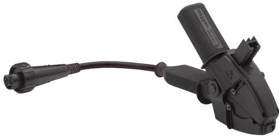
KC2-C Kelvin Clip 2 - connect Order part number: 1006-451