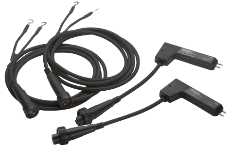
3M Duplex Handspike lead set, with connect (x2) Order part number: 1006-442