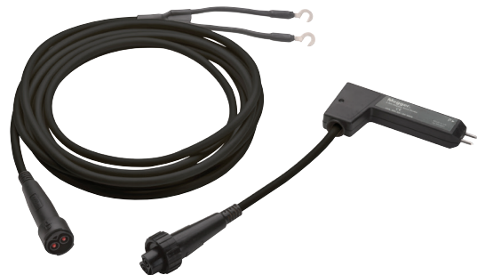
6m / 20' version of DH1-C above but only 1 included Order part number: 1006-443