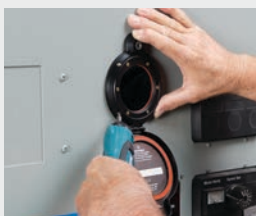
Attach and secure cover