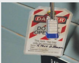
Lock out-tag out