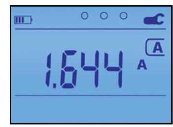
Leakage current is displayed when the optional MN72 probe is connected and the V/A function is selected. (Model 6424)