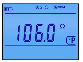
2 P mode used for continuity and bonding checks – is active when the instrument is turned on.