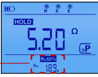
3 P mode used for measuring the grounding system. The resistance of the injector electrode and the test