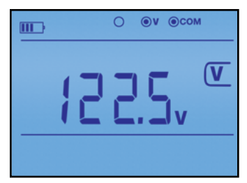
Live voltage is displayed when the V/A function is selected and test leads are connected to AC or DC voltage. (Model 6424)