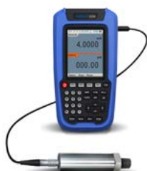
Additel 223A with ADT160A Pressure Module